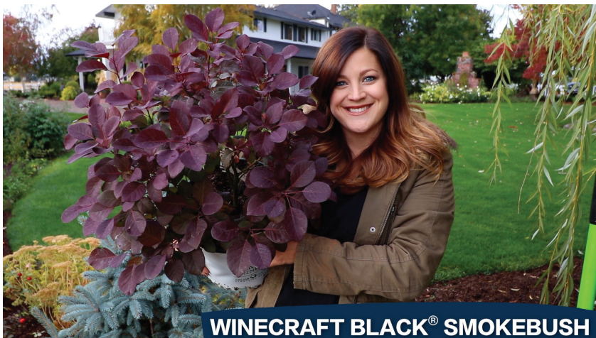
WINECRAFT BLACK® SMOKEBUSH