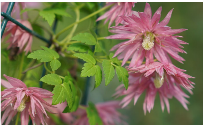
SPARKY™ Pink Clematis 'Zocoro'