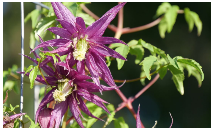
SPARKY™ Purple Clematis 'Zoocot'